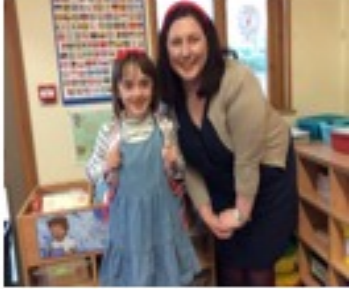
Book Week Dress Up