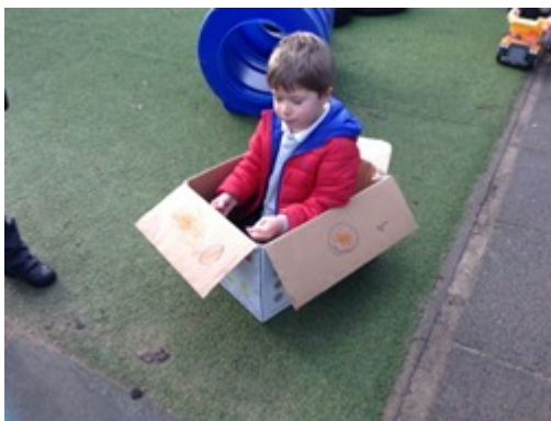
A spitfire plane!