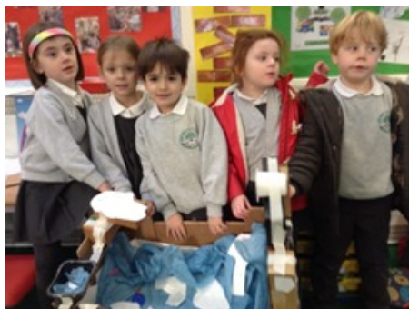
A swimming pool!