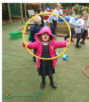
Jumping through hoops