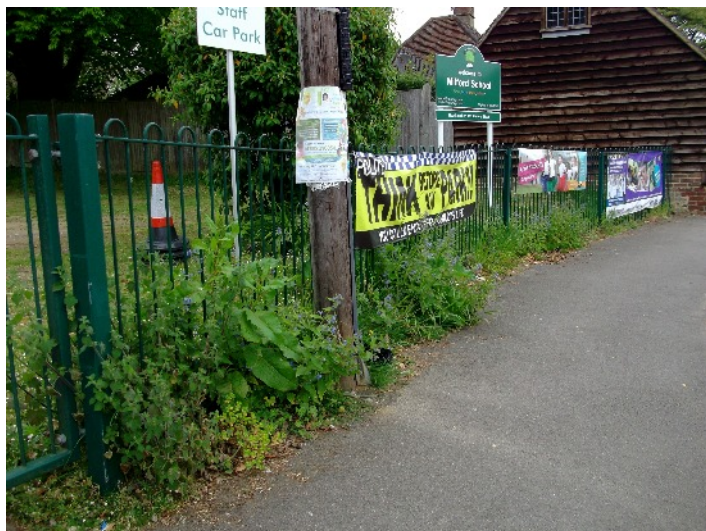
Ground Force Day - Before and After!