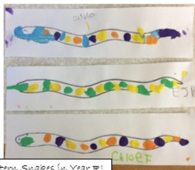
Pattern Snakes in Year 2!

Year 1 have made repeating pattern towers!