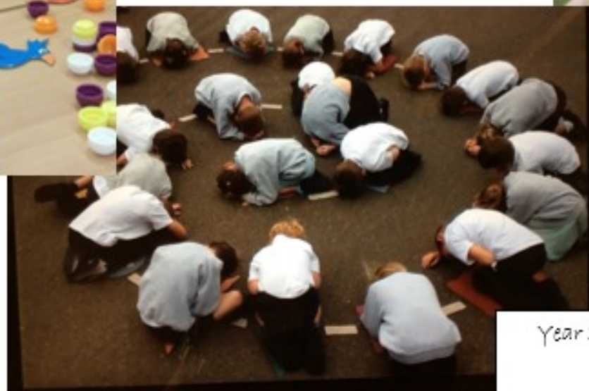
Year 2 made a pattern snail!